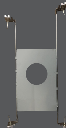
Mounting plate with hanger bars