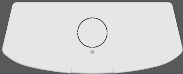
End cap view for hardwire versions