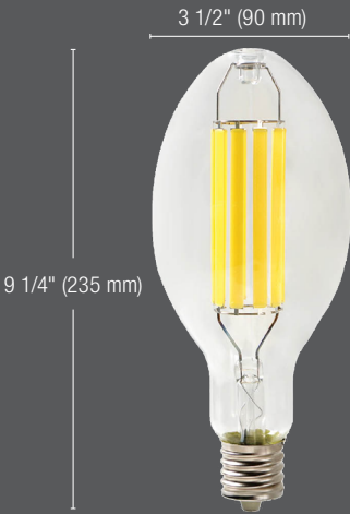
ED28 (40 W)

84% savings in first year versus Traditional equivalent 250W 1