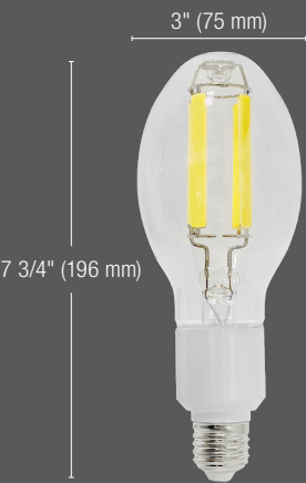
ED23.5 (20 W)

73% savings in first year versus Traditional equivalent 75W 1