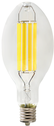
LED High Intensity lamp

With its slim neck and smaller size, it offers a better fit into existing luminaires than any other LED alternatives.