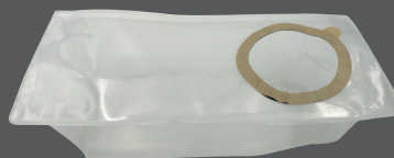
Vapor barrier extender