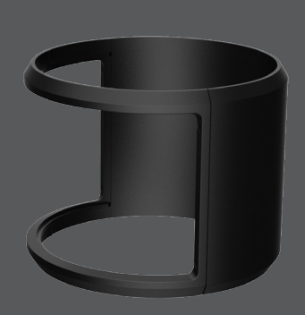
70295: 180 deg. Glareshield