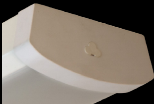
End cap view for linkable versions